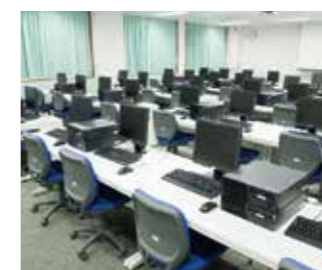
Information Processing Room