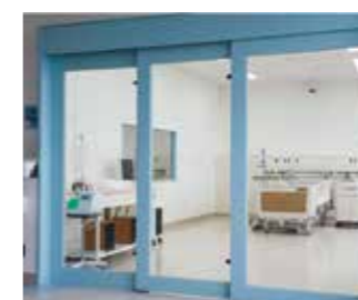
ICU Simulation Practice Laboratory