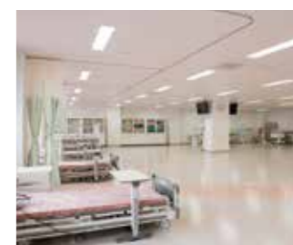
Multipurpose Nursing Practice Room