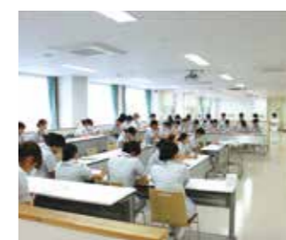
Nursing Practice Laboratories