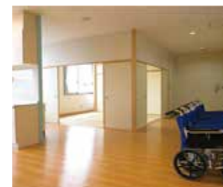
Home Care Nursing Practice Room